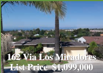
162 Via Los Miradores List Price $1,099,000