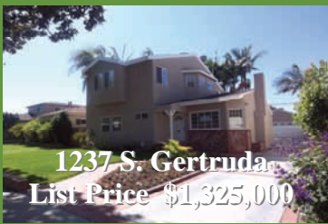
1237 S. Gertruda List Price $1,325,000