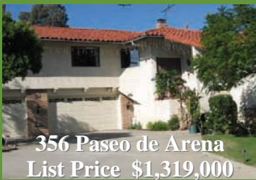
356 Paseo de Arena List Price $1,319,000