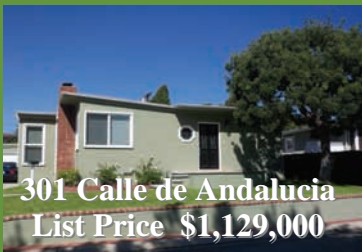
301 Calle de Andalucia List Price $1,129,000